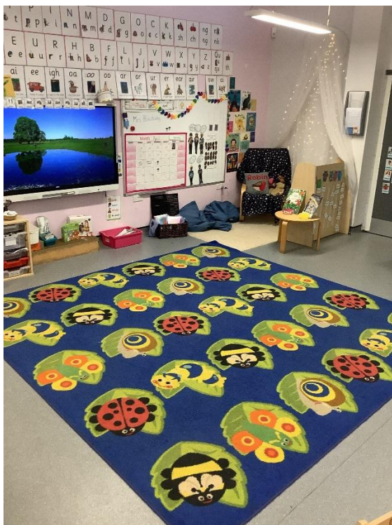
Wren's carpet area